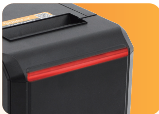
Highlighted Indicator Light Bar

Easily Cope With Noisy Environments Without Fear Of Orders Missing