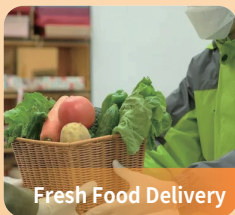
Fresh Food Delivery