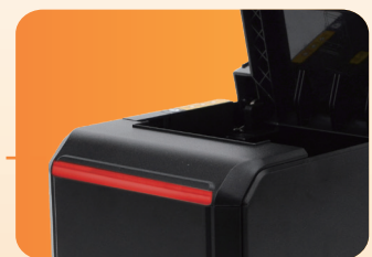
User-friendly Reminders For Paper Lacking, Cover Opening