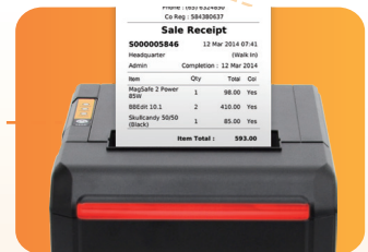
Reminder for Receipt Not Taken Away