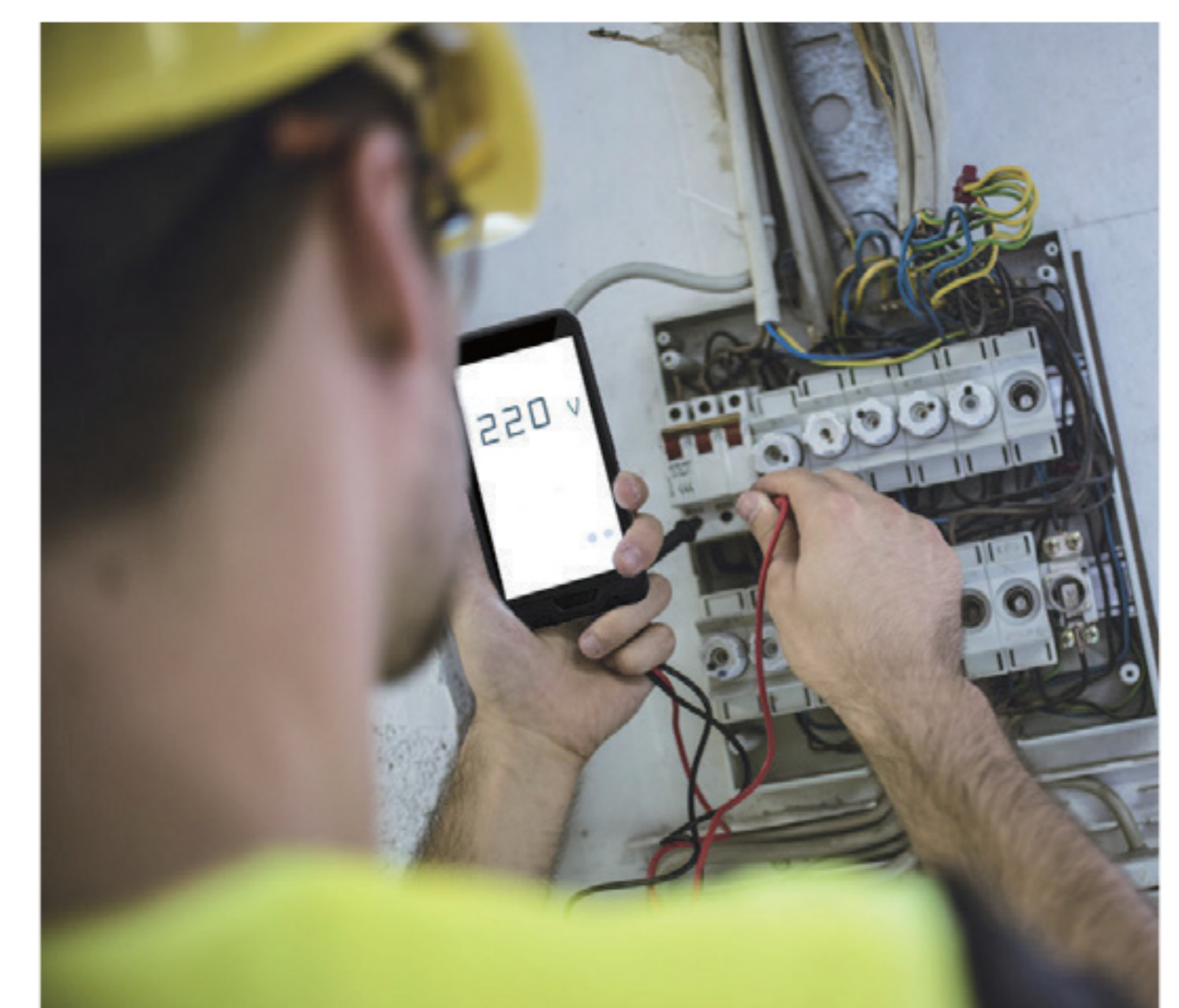
Electric Power Inspection